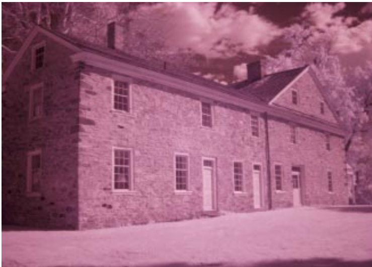
One of many upcoming SSP member events for 2009 is a thorough investigation of the historic, haunted Haldeman Mansion! This is a can't miss for serious ghosthunters!

Get ready to see Waynesboro After Dark! Sat August 22 We will travel (car pool) to historic Waynesboro, PA for a Walking Ghost Tour . We will arrive early and peruse Kindred Spirits Aroma and More , a funky shop that offers candles, herbs, journals, fairies, dragon and more cool stuff.