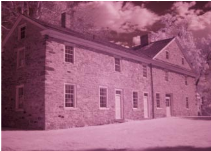
One of many upcoming SSP member events for 2009 is a thorough investigation of the historic, haunted Haldeman Mansion! This is a can't miss for serious ghosthunters!

Get ready to see Waynesboro After Dark! Sat August 22 We will travel (car pool) to historic Waynesboro, PA for a Walking Ghost Tour . We will arrive early and peruse Kindred Spirits Aroma and More , a funky shop that offers candles, herbs, journals, fairies, dragon and more cool stuff.