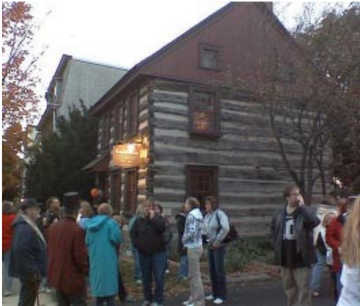
Above: The crowd rejoins the tour after walking through the authentically restored Frankenberg Tavern, Mechanicsburg's oldest structure (1801). Amongst the apparitions reported here is a headless figure seen on the roof!