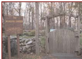
Be sure to visit the mansion's herb gardens.